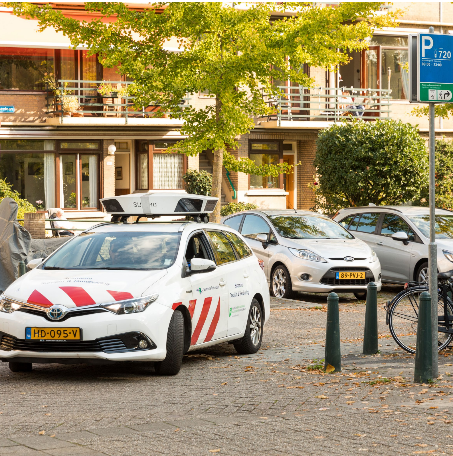
Scan car in Rotterdam.