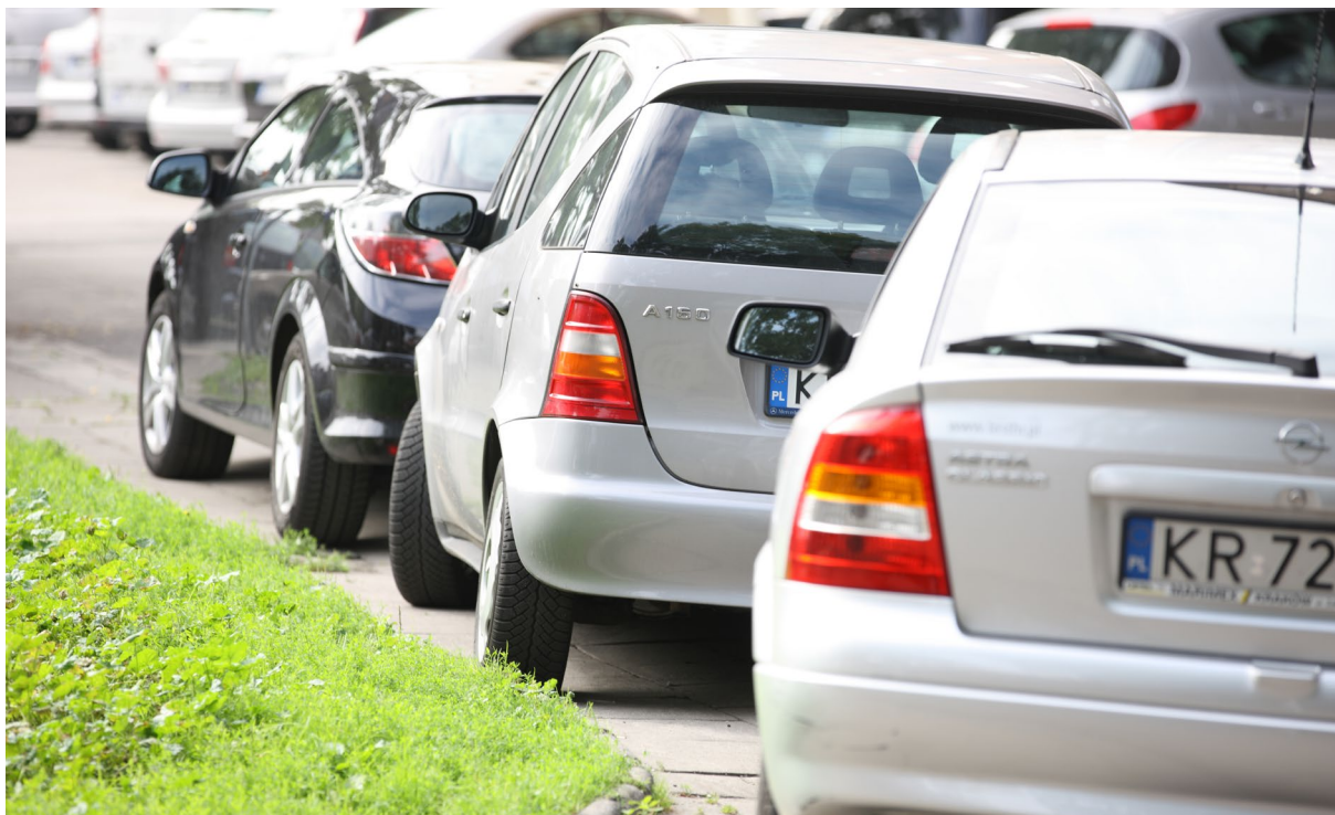
Cars parked on the sidewalks in Krakow.