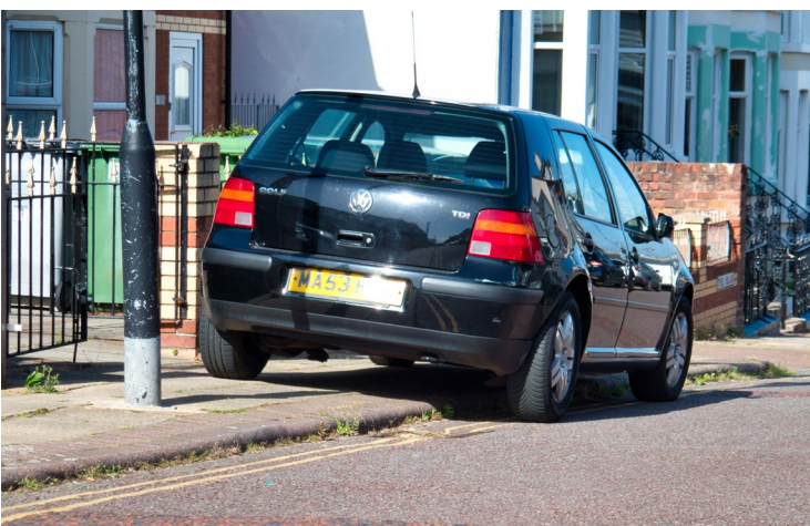
A car parks illegally on the sidewalk.

companies are fined/taxed. The advantage of this policy is that there is no competitive advantage in delaying the renovation of