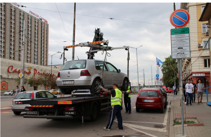
Sofia: towing of a car.

to dealing with different languages could be developed and appeals to enforcement-related decisions should be possible with minimal thresholds.