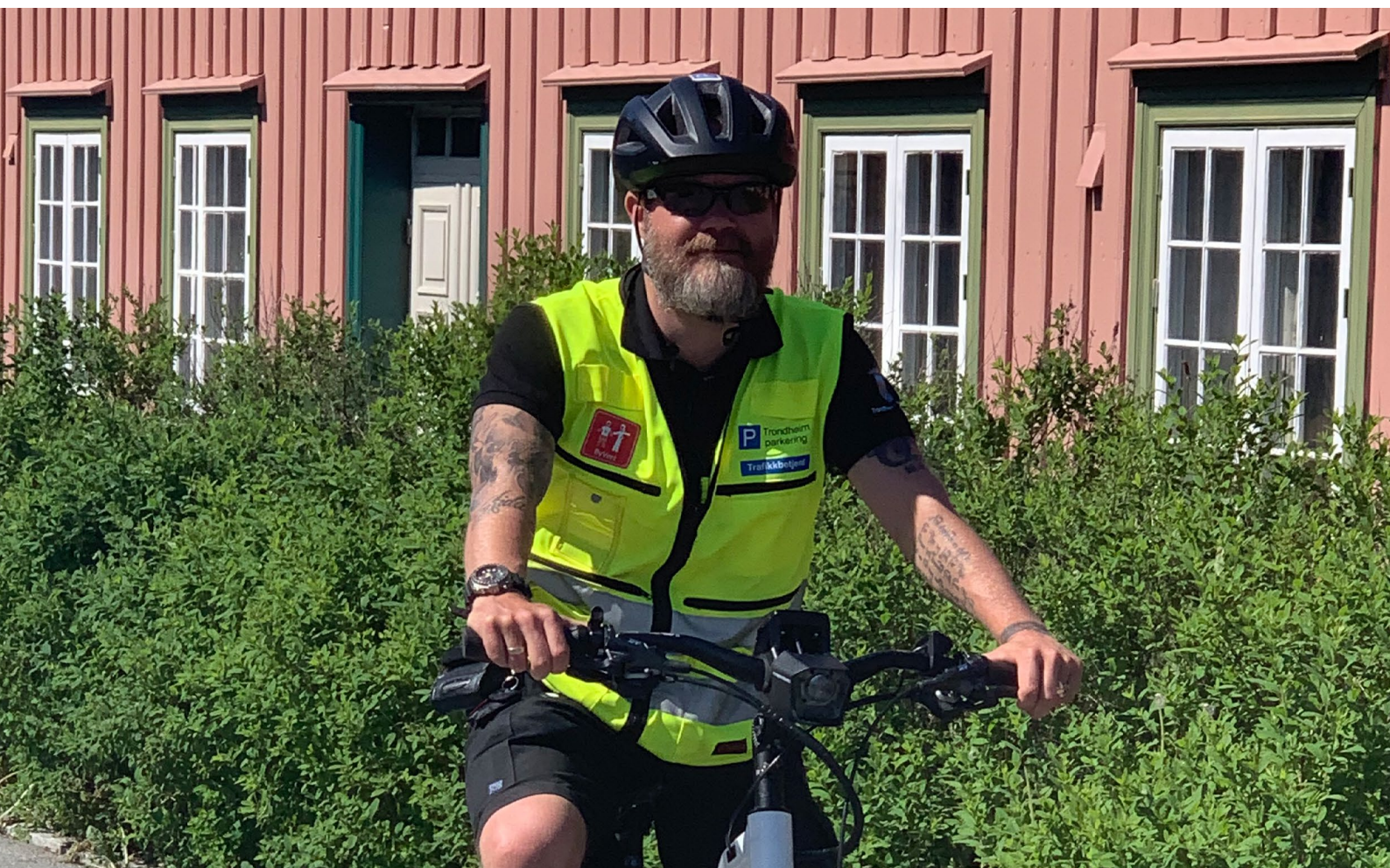
An enforcement officer in Trondheim, Norway

Before starting to discuss detailed aspects of parking enforcement, it is good to understand why cities engage in this activity. What would happen if there were no, or insufficient, enforcement? There would be chaos in the streets, citizens would feel neglected (both drivers looking for parking spaces as well as other road users), and revenue from parking would plummet. Therefore, a proper on-street parking enforcement policy envisages a balanced approach of different objectives: street regulation, service provision and revenue raising.