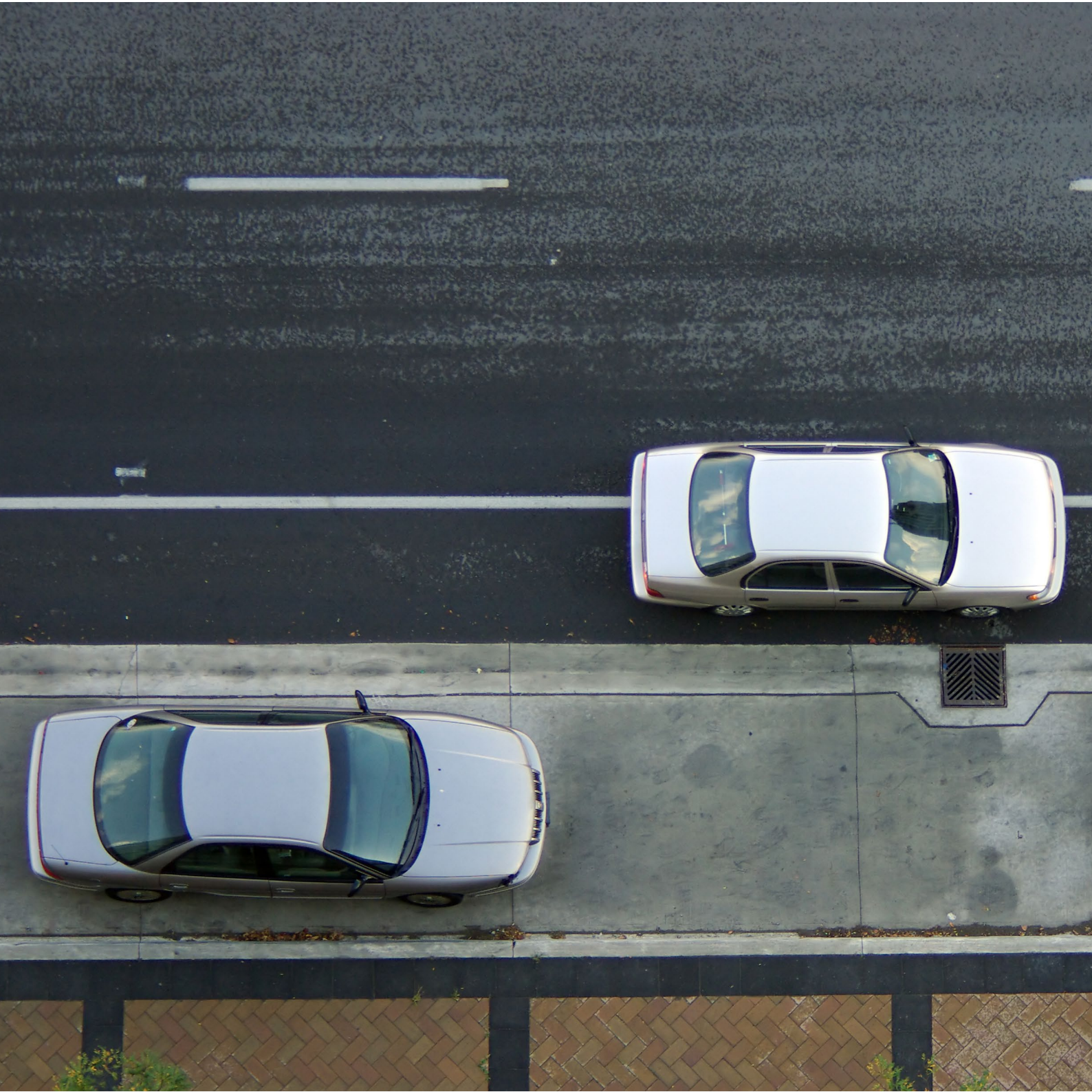
A silver car stopped on the road near car parks illegally on the sidewalk.