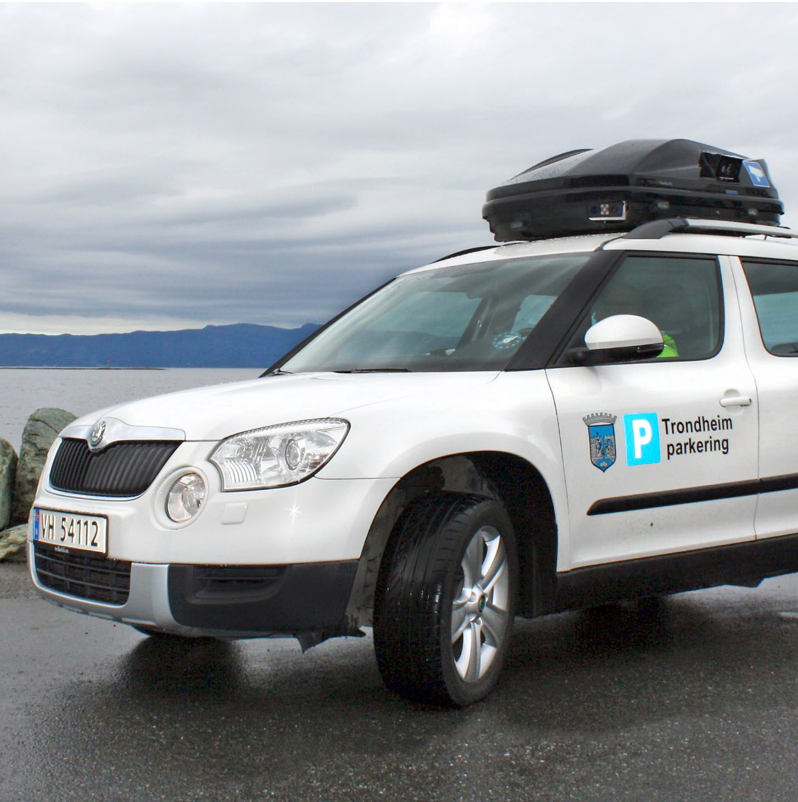
Scan car in Trondheim