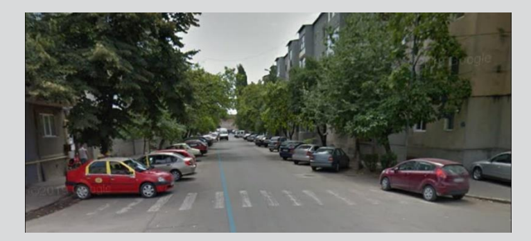
Before – illegal and abusive on-street parking